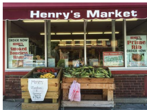
Example B. Henry's Market in Bennington has limited window advertising

Sign ordinances cannot regulate advertisement content directly. However, information sharing and community dialogue with business owners may be effective in reducing the visibility of alcohol and tobacco in a given area.