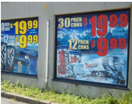
Example A. Full-window advertisements

For this reason, local sign regulations should be “content-neutral”, but can place controls on the “time, place, and manner” of signs. Regulatable characteristics include type, location, height, number, and total area of on-site commercial signs. For example, a town may wish to prevent the scale of advertising shown in Example A below. A sign ordinance could limit allowable coverage of window signs to 30% and prohibit neon or flashing signs. However, the business owner will retain the right to determine what is advertised in the permitted space.