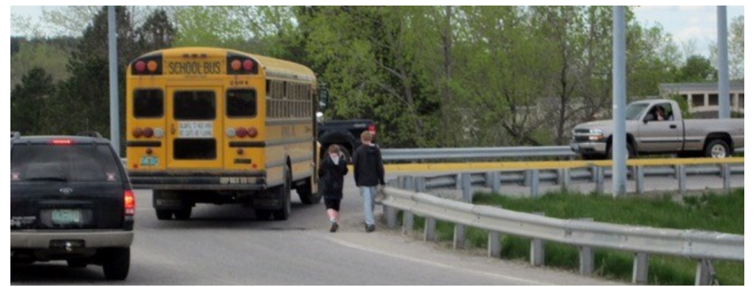
Residents will soon be able to walk and bike safely along the busy Kocher Drive corridor between Benmont Avenue and Park Street, with a safe crossing of US Route 7.

A critical transportation access and safety project along Bennington's busy Kocher Drive corridor has received the funding needed for construction to begin in the near future. The project, which includes a bikepath along Kocher Drive, a safe crossing of US 7, and connections to other existing and planned sidewalks and bikepaths in the area, was awarded a $224,000 grant through the Vermont Bicycle-Pedestrian Program. The project was selected from among thirty-one applications statewide with funding requests totaling $13.6 million. The total cost of the project is approximately $950,000, including a combination of grants and local funding.