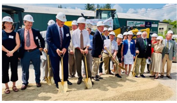
Groundbreaking at the long-awaited Putnam Block Redevelopment project.

See more coverage of the event at: <u>WCAX Story</u> and <u>Bennington Banner Story</u>.